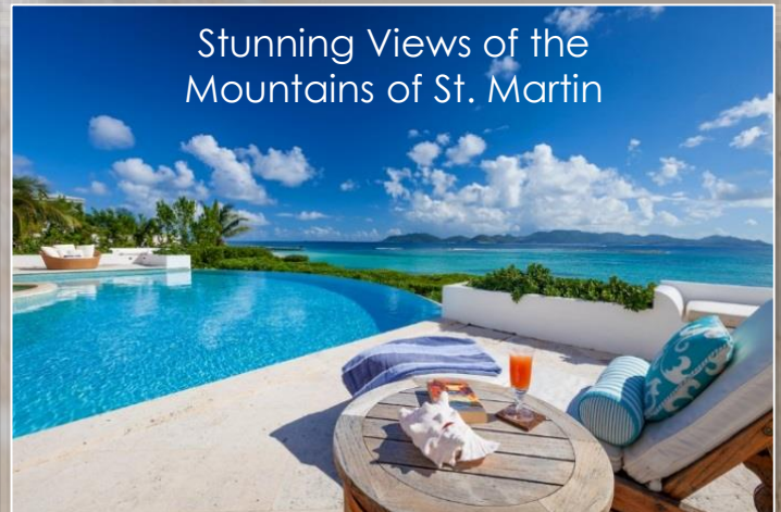
Stunning Views of the Mountains of St. Martin